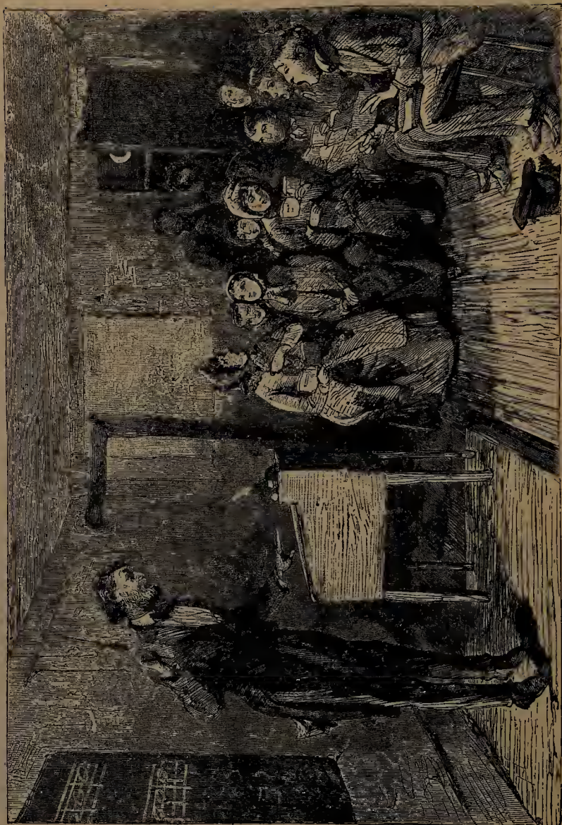
“WHAT A MONARCH HE WAS, TO US TUNE-KILLING WIGHTS.”